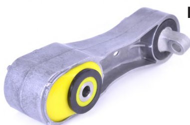
Fitted Bush + Insert

Offset so that the bore is closer to the centre of the mount