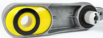
Fitted bush + Insert